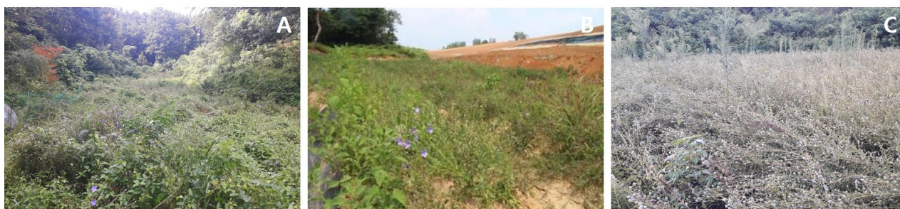
Fig. 1. Soil sampling cites for soil properties analysis at P. grandiflorum from 3 fields of Okcheon-gun, Chungbuk province. (A) Soil samples of cultivated for 5 years (non transplanted) collected from Samnam, Okcheon-gun. (B) Soil samples of cultivated for 2 years (non transplanted) and 5 years (transplanted) collected from Gwongchon, Okcheon-gun. (C) Soil samples of cultivated for 6 years (transplanted), 11 years (transplanted) and 15 years (transplanted) collected from Soseo, Okcheon-gun.